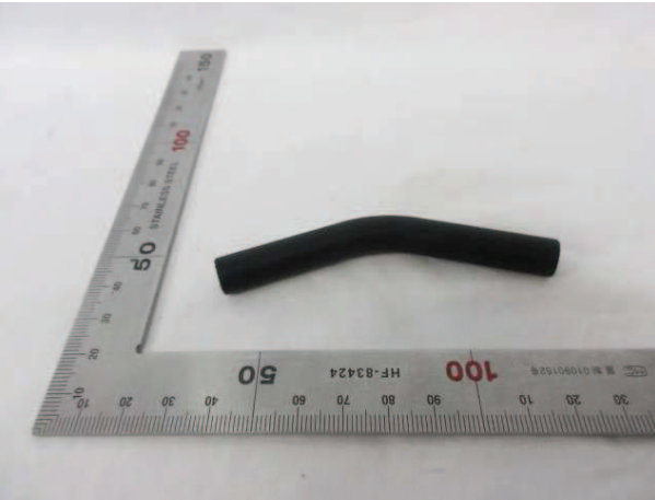
Sample No. 1-retest